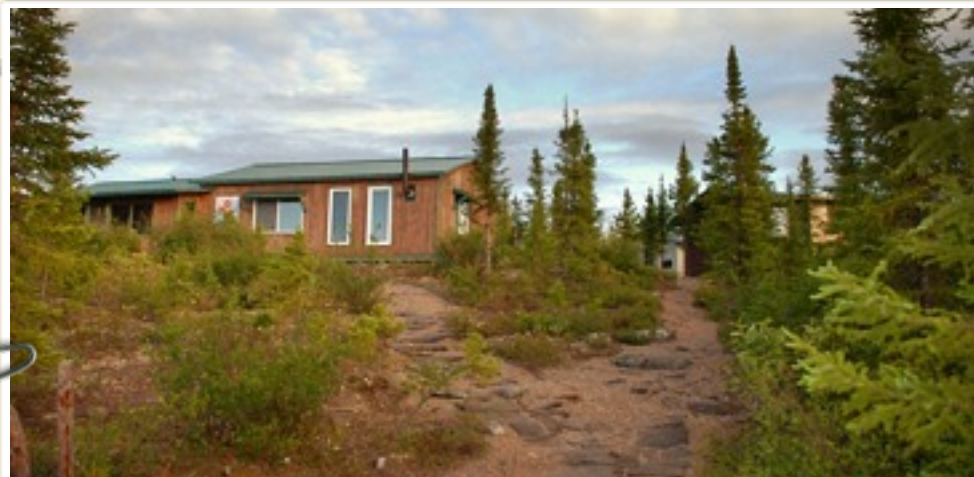
Hasbala Lake Lodge 2008 Season