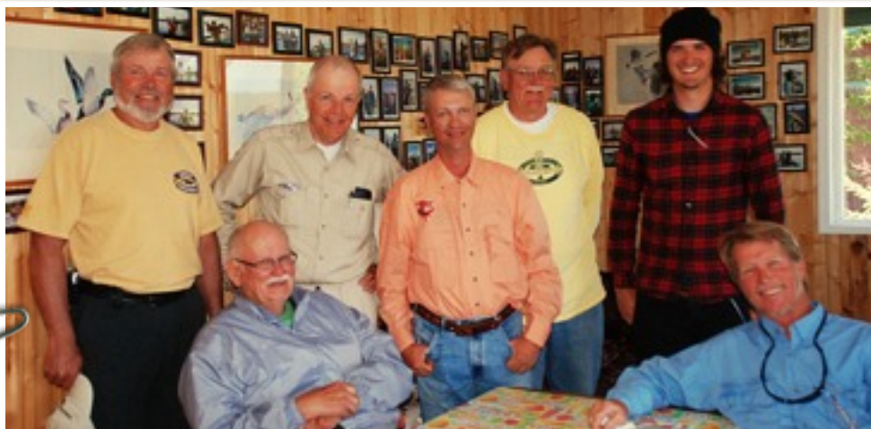
Our guests in 2009.