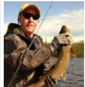
Rhonus tempor placerat.

Due to the size of Hasbala Lake, our "good fishing" is not an hour's boat ride away! There is wonderful grayling fishing only 500 yards from the lodge.