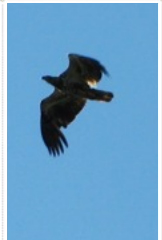
A young Eagle in Hasbala.