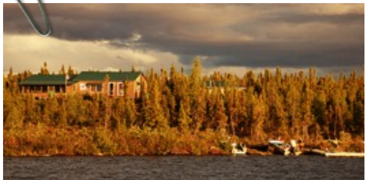
Many upgrades were made in 2008 pg. 3