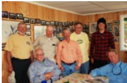
Our guests 2008 on pg. 6