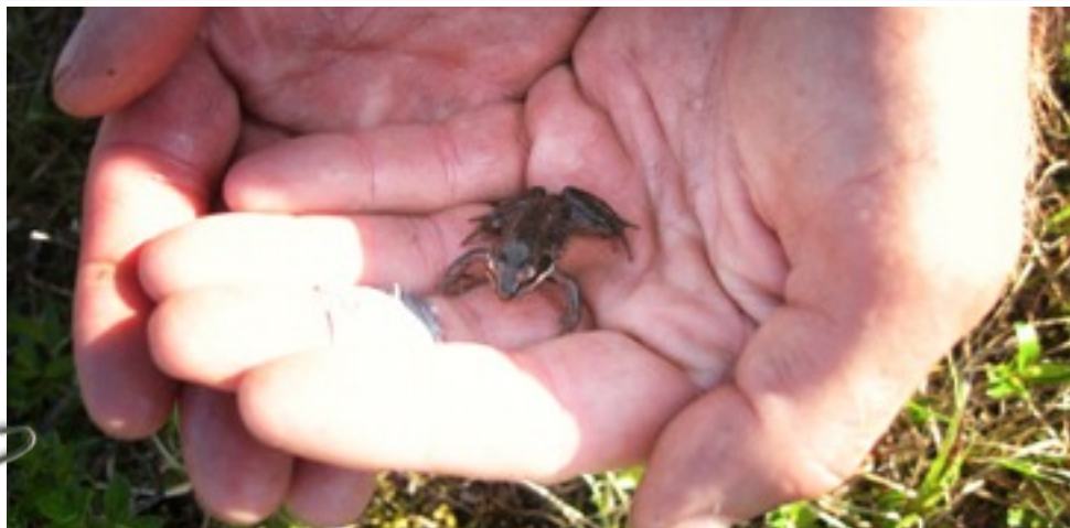
A small native frog