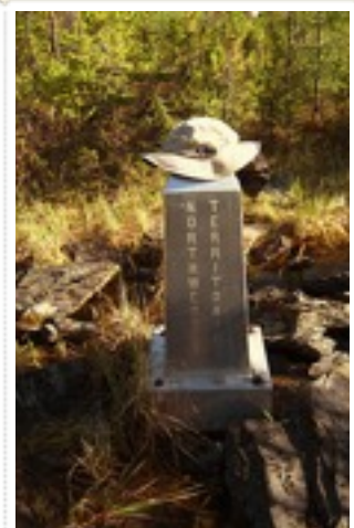
The Northwest Territories!