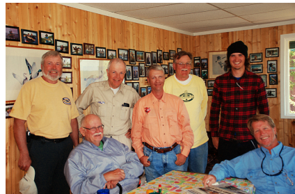
Our guests 2008 on pg. 6