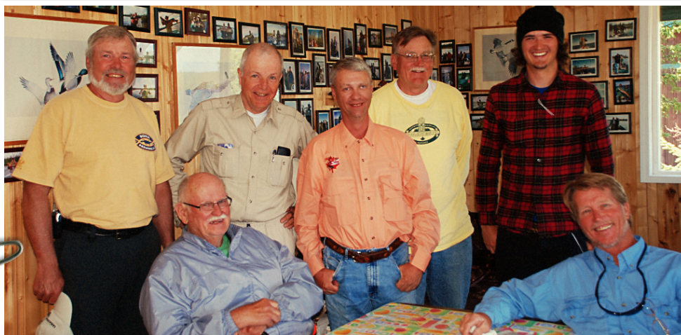
Our guests in 2009.