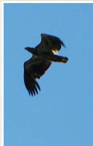
A young Eagle in Hasbala.