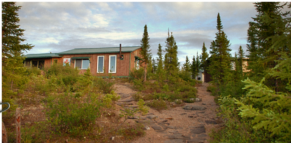
Hasbala Lake Lodge 2008 Season