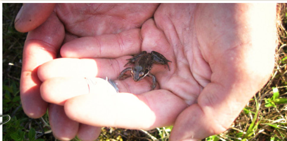
A small native frog