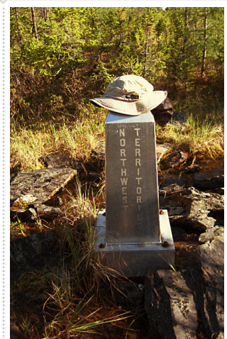
The Northwest Territories!