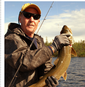
Rhonus tempor placentat.

Due to the size of Hasbala Lake, our "good fishing" is not an hour's boat ride away! There is wonderful grayling fishing only 500 yards from the lodge.