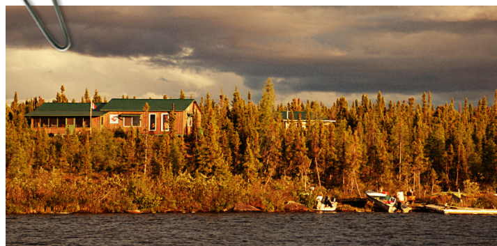
Many upgrades were made in 2008 pg. 3