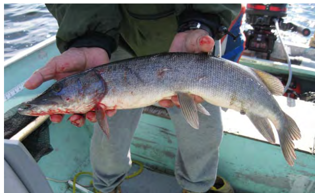
"THE OPATRIL'S CATCH ALL KIND'S OF PIKE DON'T THEY"