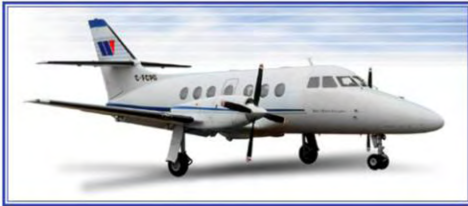
Jetstream 31 - Turbo Prop

WESTWIND AVIATION CHARTERS will be used as much as possible for Guest travel between Saskatoon and Points North, return. It'll be a direct flight and take one hour and fifty minutes. The people at Westwind Aviation are very professional.