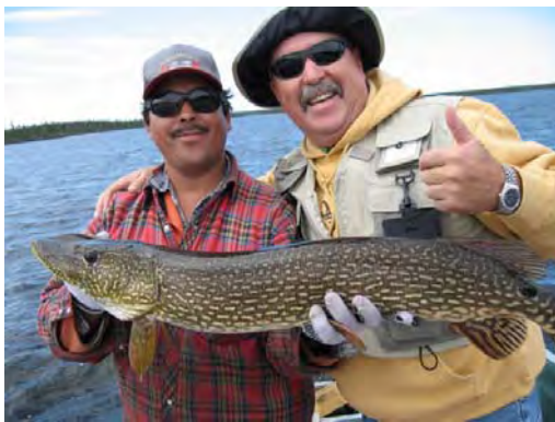
"THE TWO RONNIES"